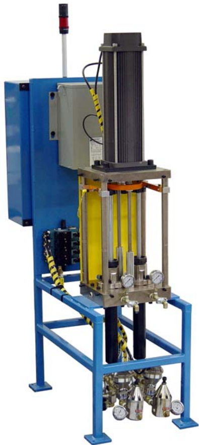
Servo-Flo 488 Meter System with Control Panel, Inlet Fluid Pressure Regulators and Control Valves