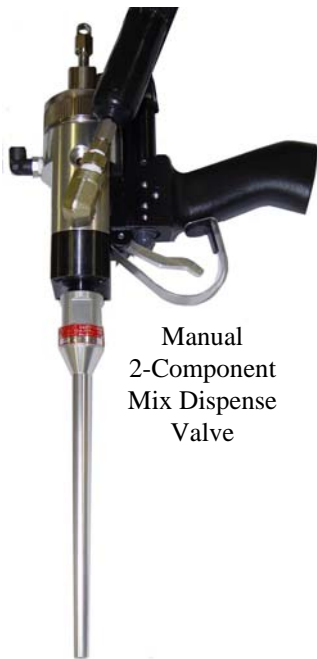
Manual 2-Component Mix Dispense Valve