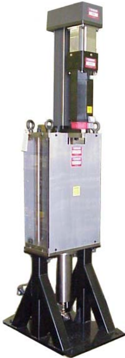
Servo-Flo 502 Shot Meter