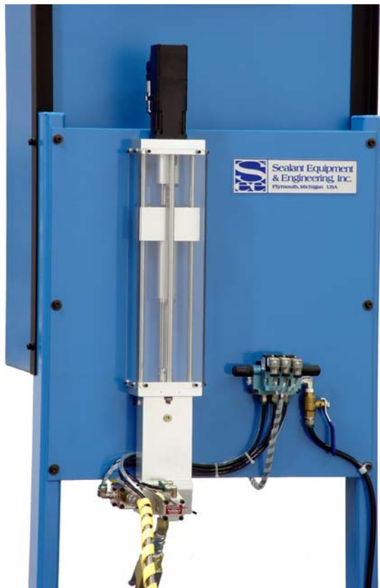
Servo-Flo 401 Meter on Frame with Control Panel