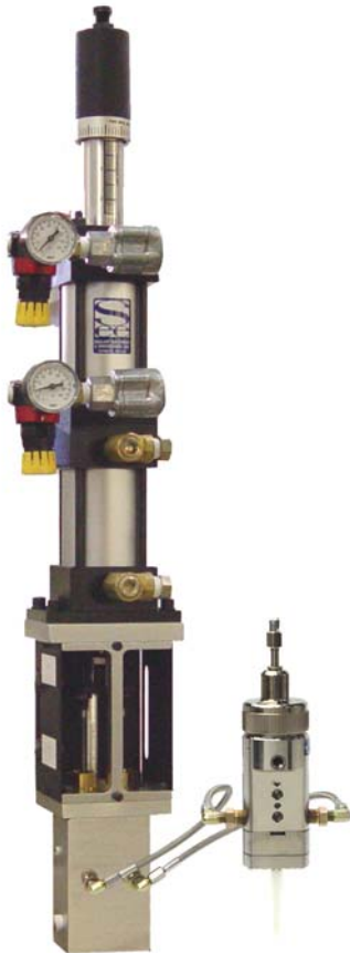
See-Flo 202 Metering System with 2200-545-037 Mix Dispense Valve